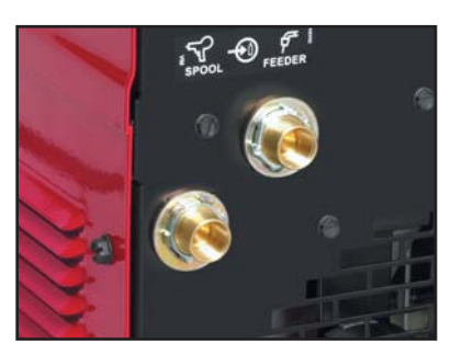
Additional Gas Solenoid – Controls Gas Flow to a Spool Gun