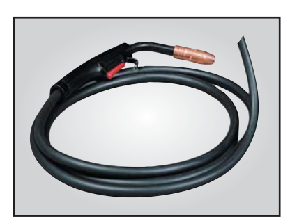
Extra-Length 15 ft. (4.5 m) Gun