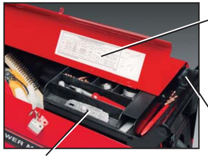
Lockable storage compartment with tool tray stows your welding consumables and valuable personal tools.