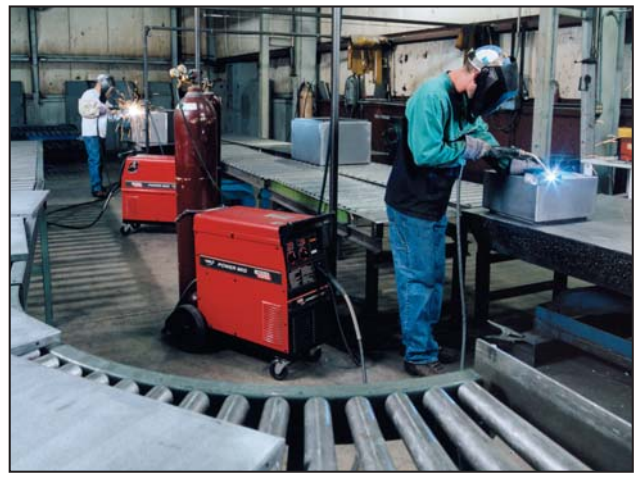
The Power MIG® 255C is a great choice for MIG production or job shop fabrication