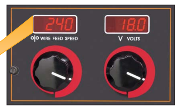
Adjust speed on the gun and watch the wire feed speed change on the Power MIG® 255C.