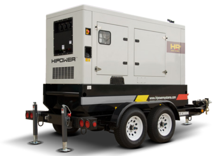
Photo depicts a typical model but may not include options such as trailer.