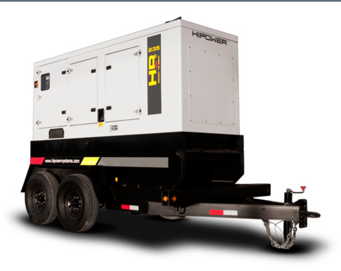
Photo depicts a typical model but may not include options such as trailer.